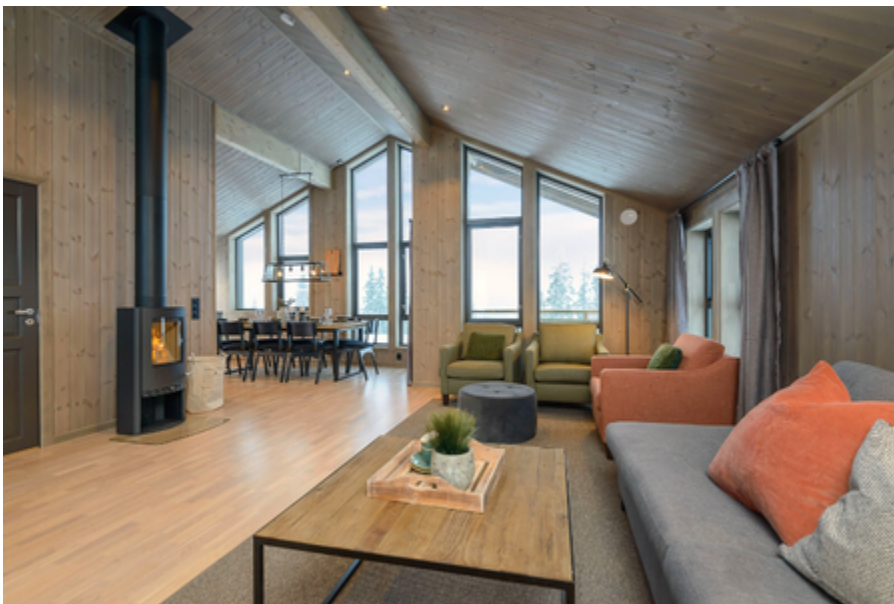
Relax in the luxurious and spacious Kvitfjell Apartments

Kvitfjell has over 600km of cross-country skiing trails. From extremely steep runs to the more leisurely slopes for beginners and families, it guarantees pleasure for all ages. Did you know that Kvitfjell is one of the first ski slopes to open yearly, as snow production covers up to 85% of the slopes? Because of this, this resort has more ski days per year!