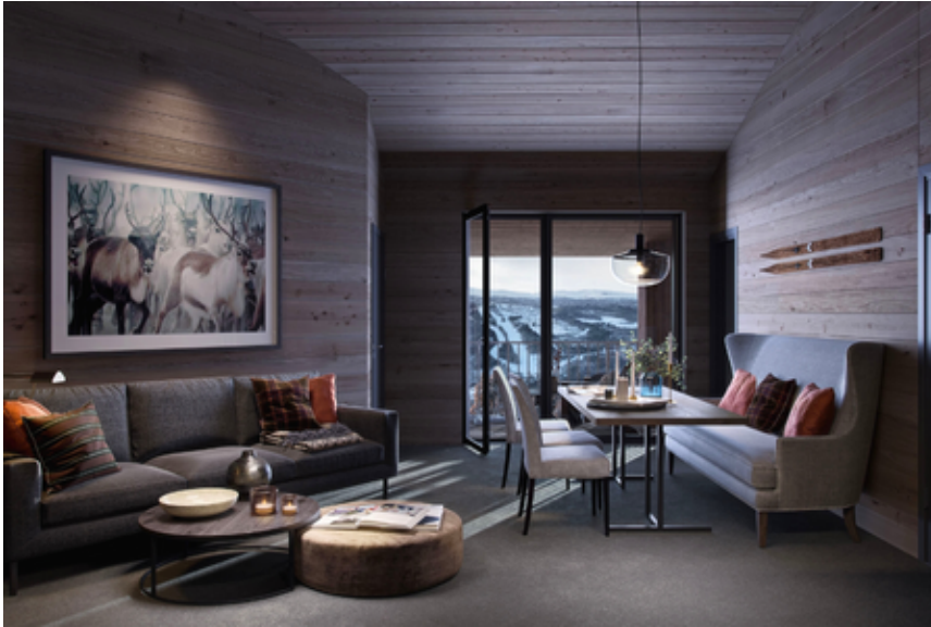
Enjoy a winter escape in Kvitfjell Apt. Yttersvingen D3.5

Kvitfjell has over 600km of cross-country skiing trails. From extremely steep runs to the more leisurely slopes for beginners and families, it guarantees pleasure for all ages. Did you know that Kvitfjell is one of the first ski slopes to open yearly, as snow production covers up to 85% of the slopes? Because of this, this resort has more ski days per year!