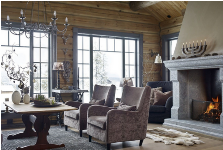
Enjoy relaxing family time in a fully furnished Skeikampen apartment.

Only 38 km northwest of the Olympic City Lillehammer, Skeikampen resort consists of a small ski village offering excellent accommodation sites in the idyllic landscapes, welcoming restaurants, and charming cafes to indulge in.