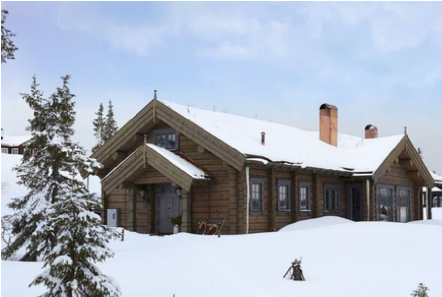
A dream-like wintery escape in one of Skeikampen's Cabins

Only 38 km northwest of the Olympic City Lillehammer, Skeikampen resort consists of a small ski village offering excellent accommodation sites in the idyllic landscapes, welcoming restaurants, and charming cafes to indulge in.