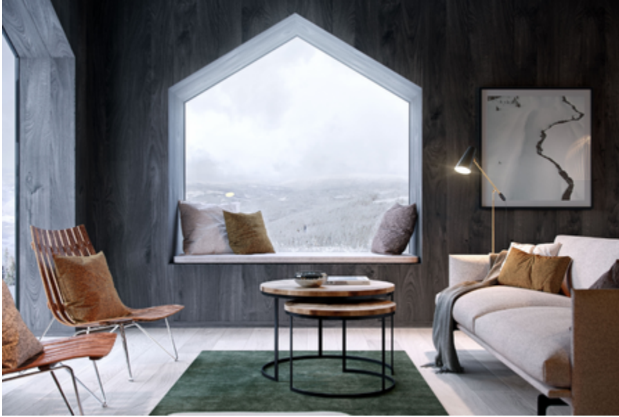
Enjoy a relaxing atmosphere in Hafjell Alpine Apartment

In 1994, Norway was host to the Winter Olympics in Lillehammer, and many downhill ski races were held on the slopes of Hafjell. As the third-largest ski resort in Norway and an Olympic arena, it offers around 47km of slopes and several terrain parks with challenges for everyone to participate in and enjoy.