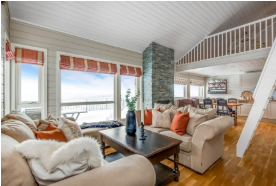
Experience views from the living room and dining room in Hafjell Apartment Geitryggen

The skiing area in Hafjell is mainly on the sunny side of the mountain and is sheltered from the wind, making it the dream destination for your log cabin holiday. From the summit, you can access 300km of prepared cross-country tracks, and those who are active skiers can attempt the Kjus Run. Children's areas can be found in the valley at the top of the Gondola, Mosetertoppen, and Gaiastova on the top of the mountain.